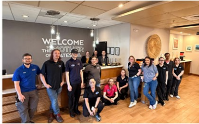
Team at CSBHH with their well-deserved award!

We also celebrate our Asheville HGI property for winning the 2025 Circle of Excellence Award from Hilton, recognizing their top-tier performance within the top 3% of the brand.