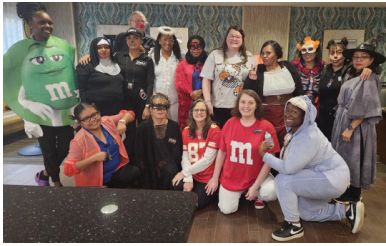
Hampton Inn Winston-Salem's Halloween costume party

Would you like to have a team photo featured in a future Oiler issue? Please send it to marketing@qocnc.com