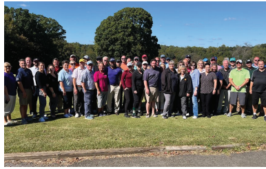
Group photo from the annual leadership golf outing