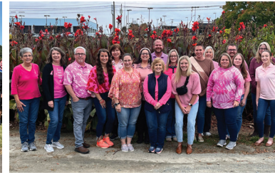
Wear it pink day team photo from Friday October 20th