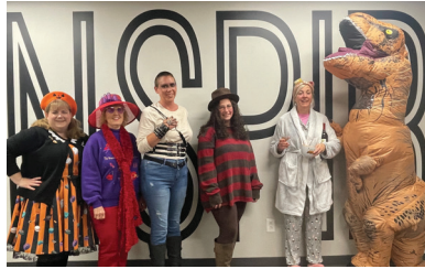
Home office Halloween costume contest participants