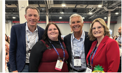
Christiansburg leaders with the Hilton CEO at Ignite the Light