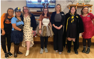
Hampton Inn Christianburg's Halloween costume party