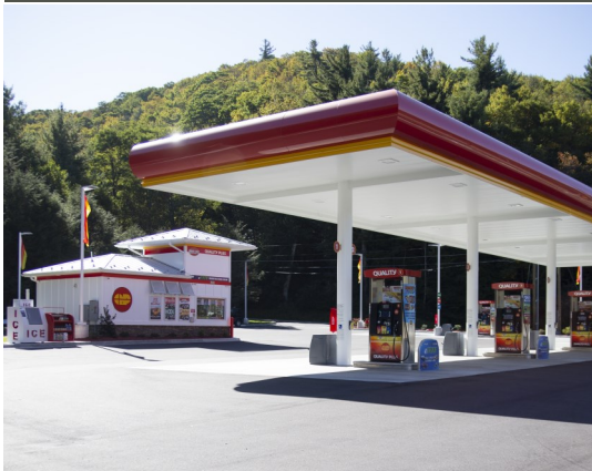
Blowing Rock, NC Quality Plus